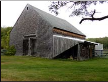
Barn, Greenleaf Homestead