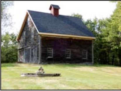
Barn, Heal Mill House

Family Cemeteries, Barns, Wells and Well Houses, Stone Walls, Carriage Houses, Stone Wharves, Tide Mill Foundations, Dock Piers and Pilings