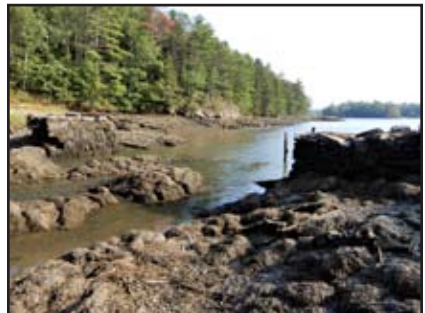
Heal Upper Tide Mill Foundations, Heal Cove