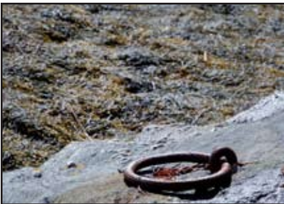
Mooring Ring, McCarty Cove