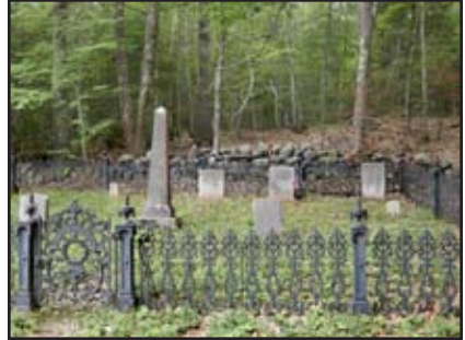
Samuel Tarbox Family Cemetery